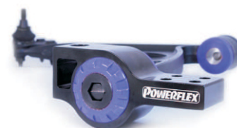
Left-hand wishbone fitment shown